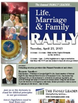
8.5 x 11" Poster