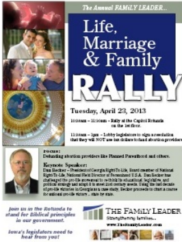
8.5 x 11" Poster