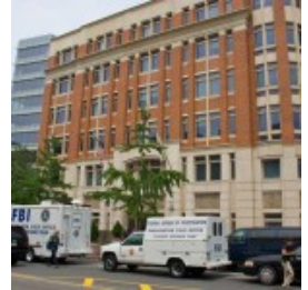
FRC headquarters in Washington, D.C.