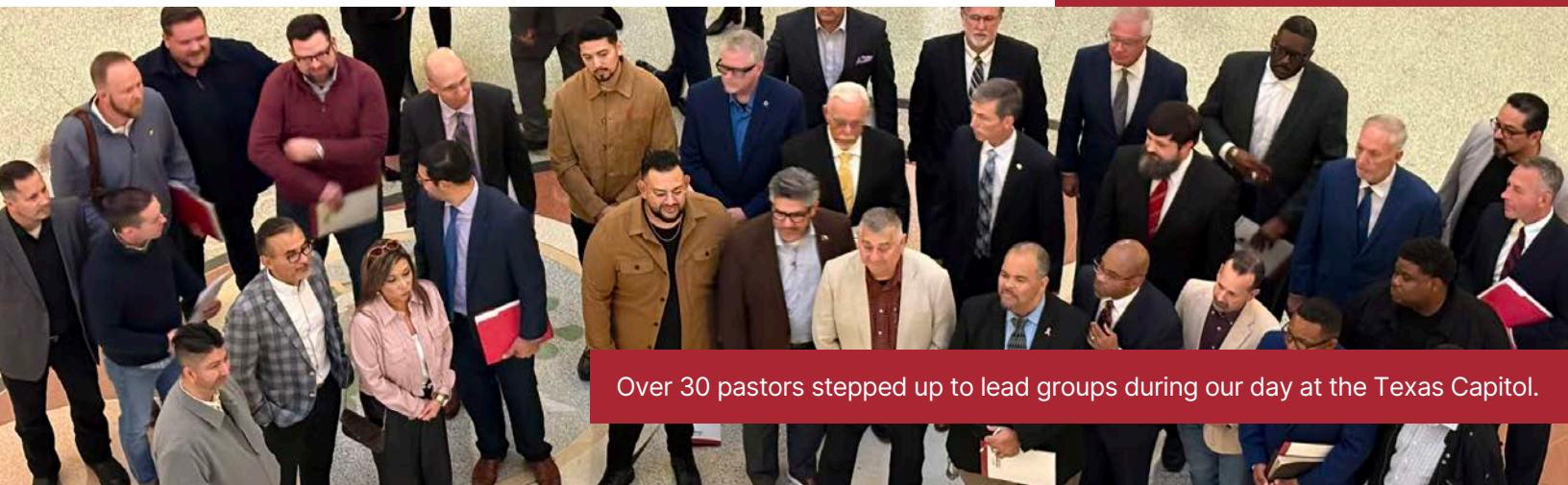
Over 30 pastors stepped up to lead groups during our day at the Texas Capitol.